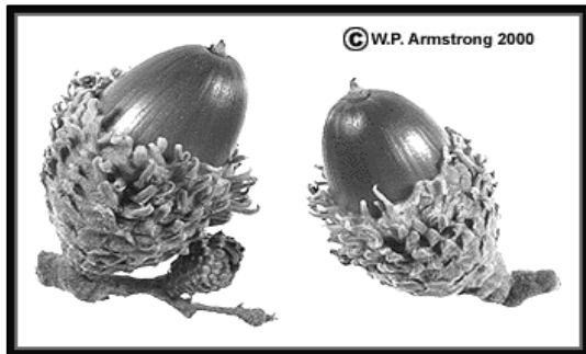
Acorn: Nut of the oak trees.